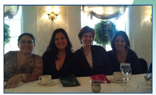
The CIE Staff take a moment out of their busy schedules to celebrate the holidays and the successful submission of another grant proposal

tutes of Health Institutional Research and Academic Career Development Awards (NIH-IRACDA). Submission of the proposal was a significant undertaking that required the generous support and efforts of faculty, staff, and administrators across several campus departments. If selected as an award recipient, the IRACDA proposal could bring $6.6 million to Stony Brook University to fund a potential 30 IRACDA Post Doctoral Scholars. This semester, the Center is working on several other grant initiatives. The Center expects news on the IRACDA proposal in late spring. Stay tuned to our Facebook fan page to find out if we were selected!