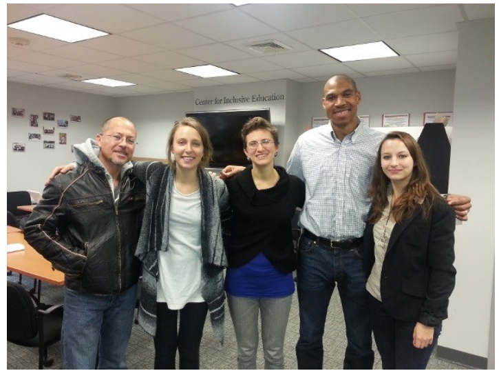
Congratulations to November Research Café presenter and Turner Fellow