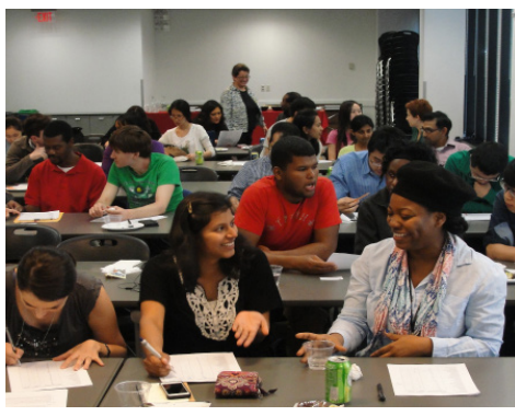
Workshop attendees collaborating on a task

The four topics within the Practical Professional Skills Series explored navigating complex organizations, giving and receiving constructive feedback, time and energy management and strategic professional growth. The CIE and IREP would like to thank the speakers who shared invaluable information and provided guidance to the graduate students and postdocs who participated in the series.