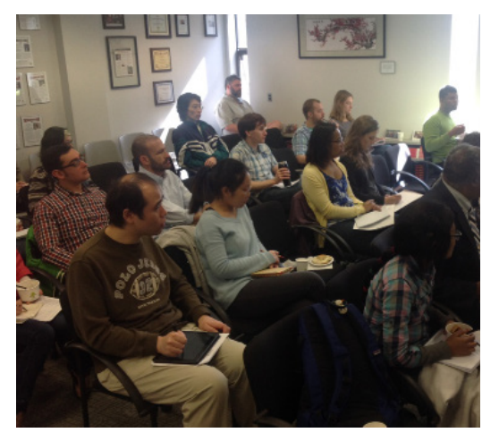
"Negotiations" workshop audience

The CIE would like to thank the speakers, panelists and moderators who helped make Faculty Career Week an invaluable wealth of information and resources for attendees.