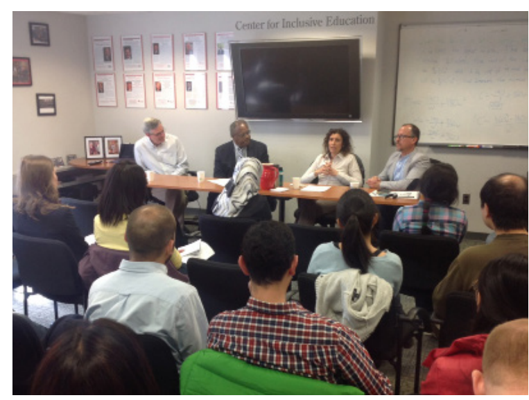
"Negotiations" workshop panelists share insights about the hiring process