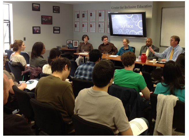
"Interviewing Skills" workshop panelists answer questions about the different stages of the onsite interview

On Thursday, April 30, the series continued