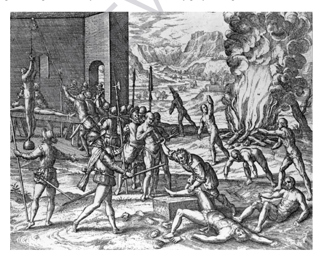
Figure 6. Spanish atrocities in the New World (~1590), Theodor de Bry

showing the violent behavior of the conquistadors and their lust for gold, were recreated in the film Orinoko Nuevo Mundo . On the other side of the Atlantic, Theodor de Bry (1528-1598) created a large number of engraved illustrations depicting early European expeditions to the New World. De Bry never traveled to America. To make his engravings, he relied on texts and paintings created by people that made the journey. Today, historians, geographers and archeologist believe that de Bry distorted reality to produce many of the images that appear in his engravings. The distortion helped to sell the engravings to a general public that was avid for news about America. The engravings were a point of reference for many Europeans. De Bry's depictions of the Spanish atrocities described by Bartolomé de Las Casas in his Breve Relación de la Destrucción de las Indias (for an example, see Figure 6) had a tremendous influence in spreading the Black Legend of Spain. The myths and truths of de Bry play an important role in La Luna