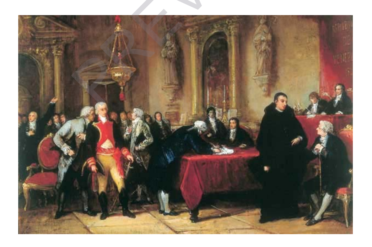
Figure 1. Firma del Acta de la Independencia (1877), Martin Tovar y Tovar