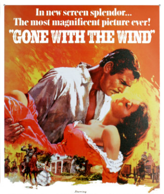
CLARK GABLE · VIVIEN LEIGH · LESLIE HOWARD

slavery often comes from media popular images-especially movies. Classics like Gone With the Wind. like television miniseries ROOTS and even lesser known independent films like