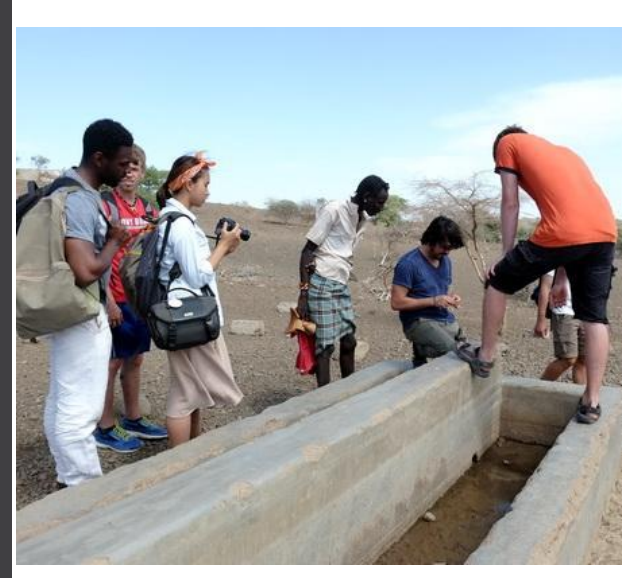
CEAS Global Innovation Program at TBI

Transfer Articulation will eliminate the previously used transcript supplements and make the process of transferring study abroad credits back to Stony Brook more efficient for students, academic departments and administrative offices. IAP looks forward to continued cooperation with the Registrar Office, ATAS and all academic departments at Stony Brook University.