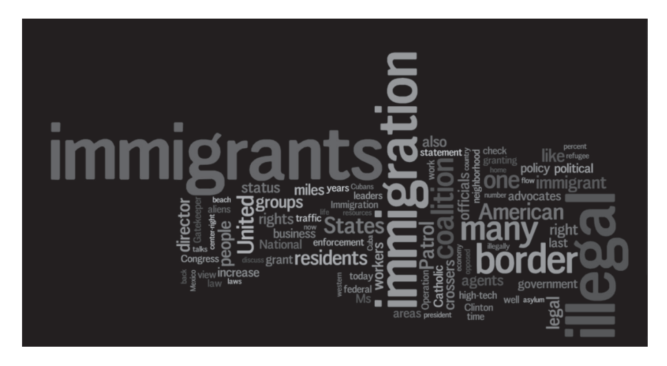
Figure 6.1a Word Cloud: Pre-9/11 Media Content.