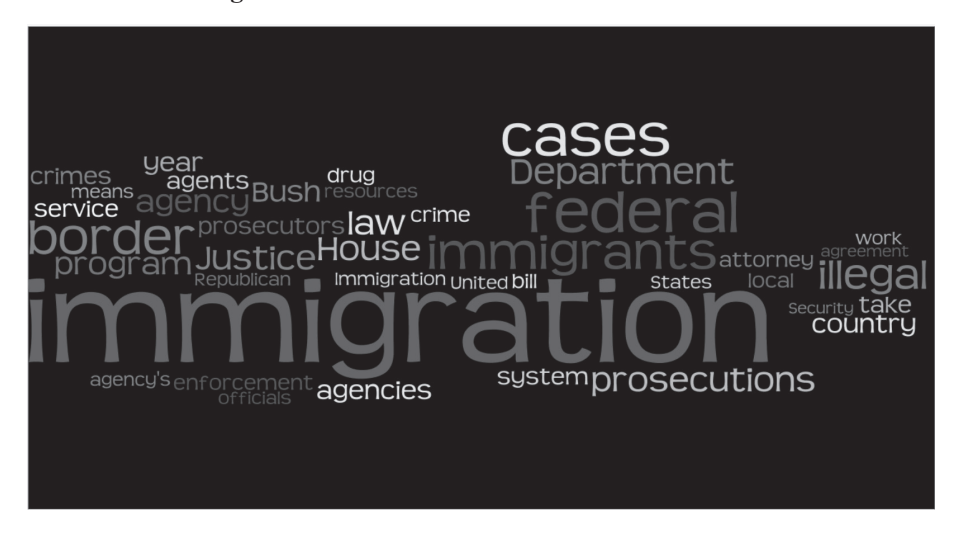
Figure 6.1b Word Cloud: Post- 9/11 Media Content.

serve to organize political debate and ultimate policy resolution, on immigration the process has appeared less clear.