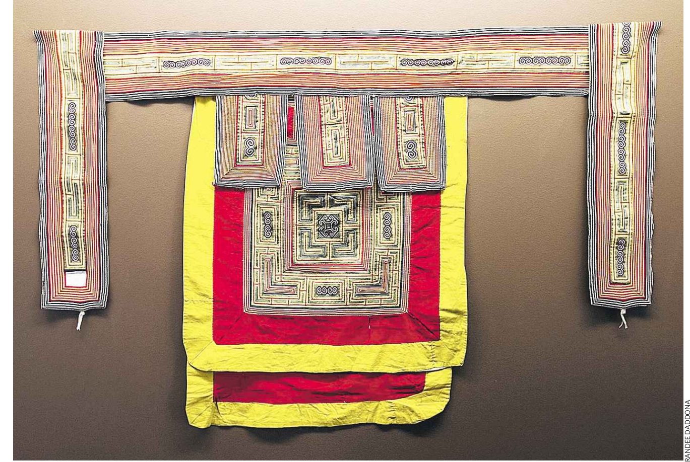
A Miao baby carrier, considered an heirloom, on view at Stony Brook University's Charles B. Wang Center.